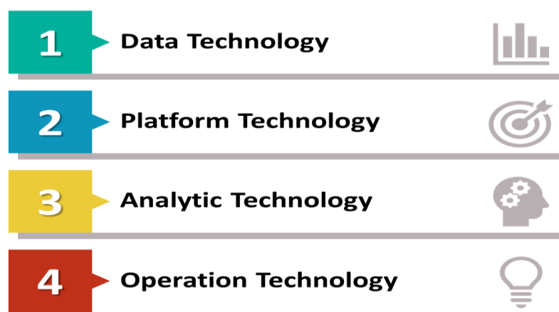
Figure 3. Four major categories of unified architecture for industrial AI includes

Industrial Artificial intelligence (AI) is a systematic discipline to enable engineers to systematically develop and deploy AI algorithms with repeating and consistent successes. Successful implementation of Industrial AI will improve decision making and provide enhanced insight to business users - whether that's reducing asset downtime, improving manufacturing efficiency, automating production, predicting demand, optimizing inventory levels or enhancing risk management. A unified architecture for industrial AI includes four major categories (Figure 3).